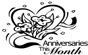
Anniversaries This Month